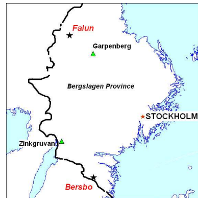
Location of the airborne surveys at Falun and Bersbo

Airborne electromagnetic (EM) methods are a powerful group of exploration techniques used by mineral resource companies in the search for base and precious metal-bearing, massive sulphide deposits. EM techniques have been highly successful in directly identifying commercial deposits of metals on most continents.