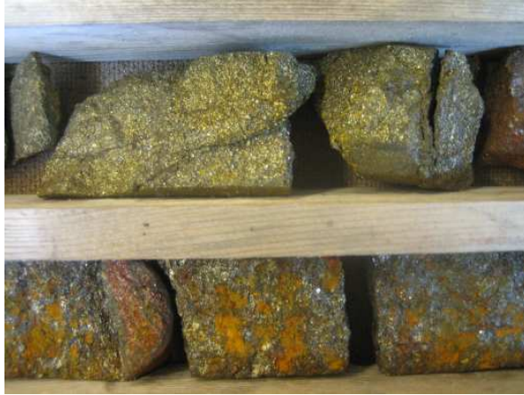
Sulphide minerals in drill core, Falun

The main orebody mined at Falun over the past 1400 years contained a very large connected mass of massive sulphide which would have been an excellent EM conductor. The targets of the exploration at Falun are subcropping commercial bodies of these sulphide minerals that have not yet been detected.