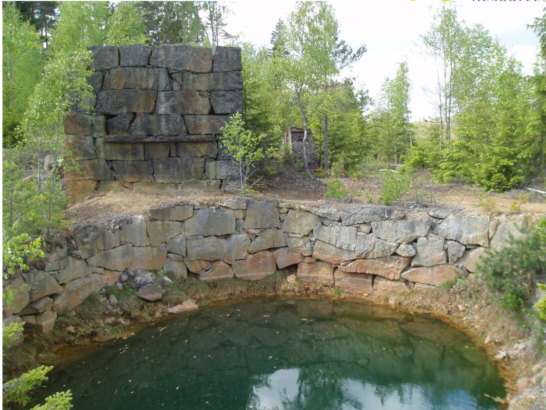
Water filled shaft of the Grönhög mine