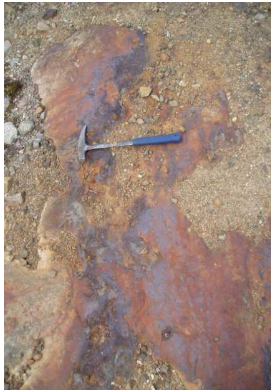
Pyrrhotite gossan along strike from the mine

The Alliance is currently flying an airborne VTEM survey over both the Drake-Zinifex and Kopperberg licences. It is anticipated that the VTEM will be key to defining drill targets in the district.