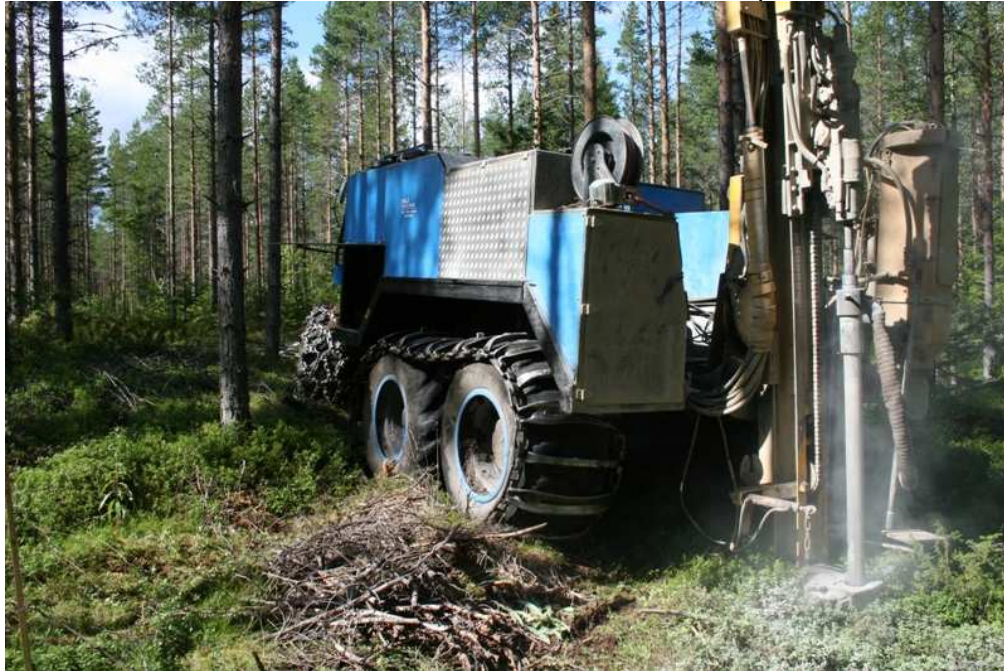
Figure 1: Drilling at Grönhög