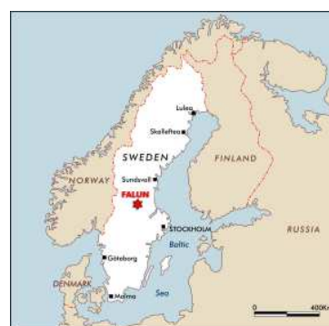
Sweden - Falun Location Map