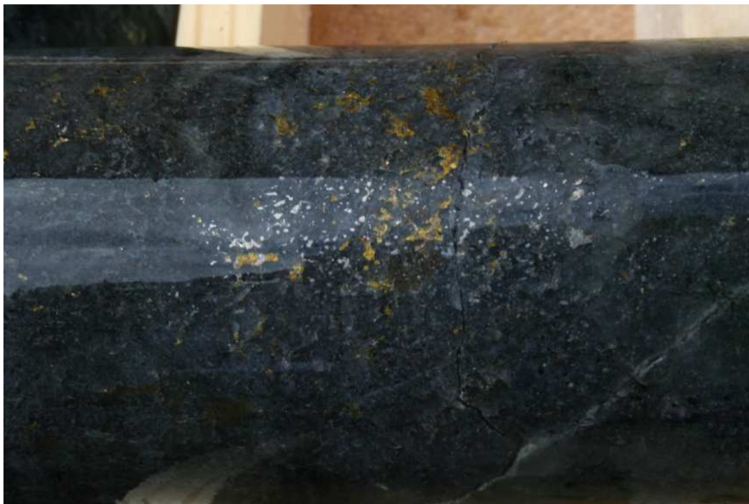
Photograph 1. Silicified vein with chalcopyrite (gold colour) and bismuth (silver colour).