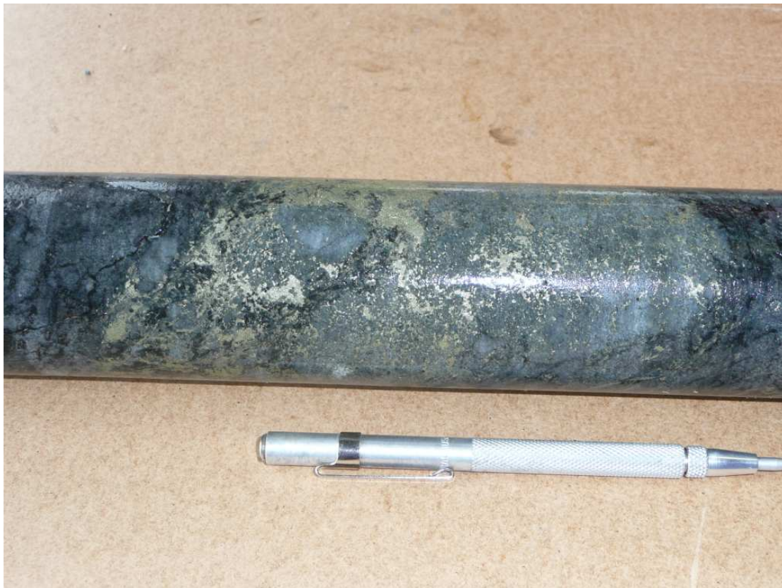
Photograph 2. Silicified vein with chalcopyrite and pyrite