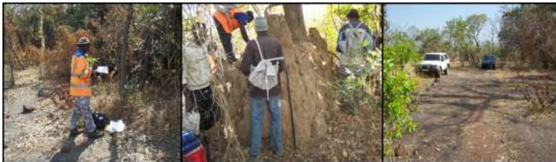
Termite mound sampling on Drake's Samekouta Project

Final analytical results are expected in early 2012 and follow up of new targets will include pitting on anomalies and RC drill testing if warranted.